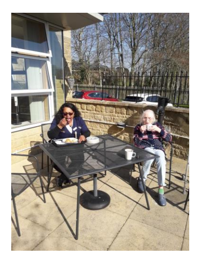
May spending some time with one of our Nurses in the garden.

Our residents enjoyed some sun and fresh air this month in the garden.